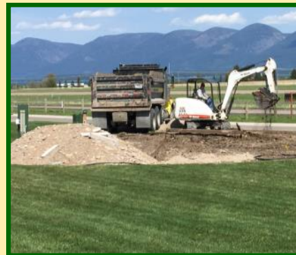
Lots of changes being made at Site #173