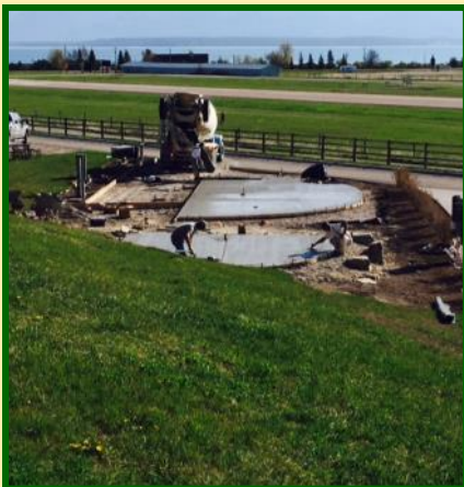
Construction at Site #190