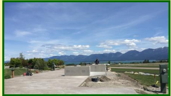
Construction in the Sun!